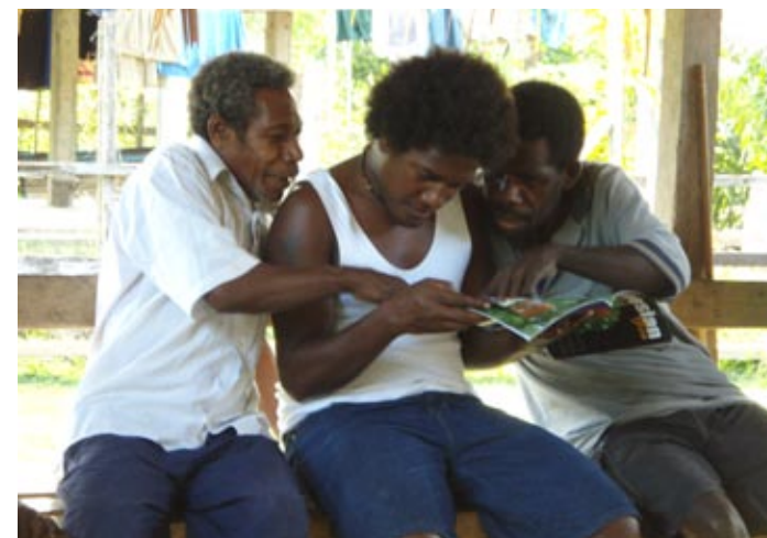
Melanesian Geo read by village communities in rural Solomons.