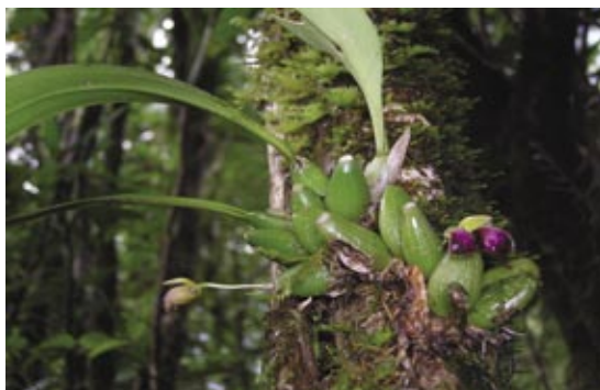
Orchid of Solomons

Each time, our articles cover a broad range of stories. This issue is no different. Stories in this edition include adventures in Matantas on Vanuatu's island of Santo, the submarine volcano of Kavachi 25 nautical miles off the islands of Gatokae and Vangunu in the western Solomons, threat of undersea mining to the seabed and marine organisms, the threat to Fiji's sago palm, conservation and how it is serving communities in a rapidly changing world, the importance of agro – forestry on Choiseul island, a recent marine natural survey, and the of a rare tree products destruction species in the Solomons. Finally there is a travel story on Marovo Lagoon, and terrestrial environment threatened by such as logging and mining.